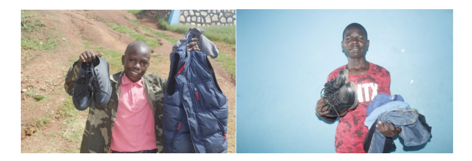
Some of the children showing off their Christmas gifts from the sponsors.

The children were also blessed with gifts from their sponsors and well-wishers. We are so grateful to all those that gave towards the meals and gifts of the children. May the good Lord truly bless you.